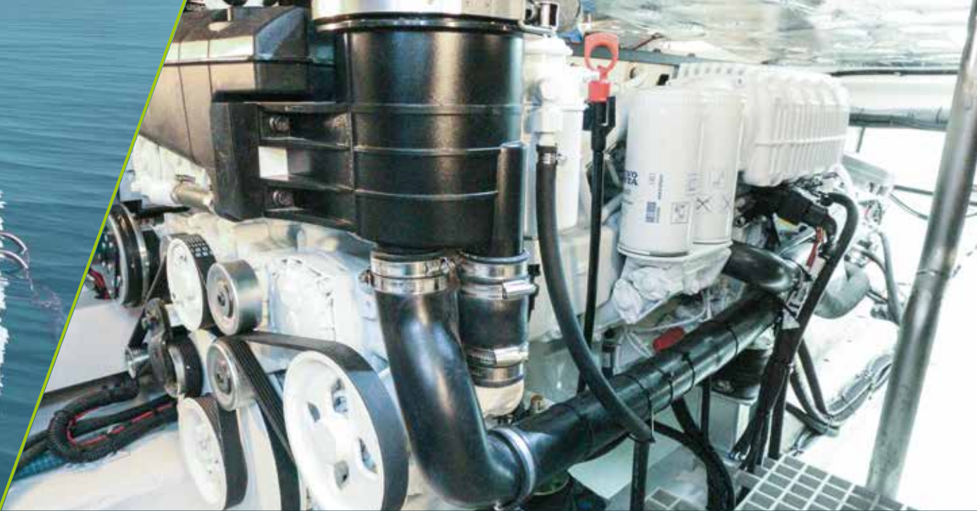
IPS600 double engine