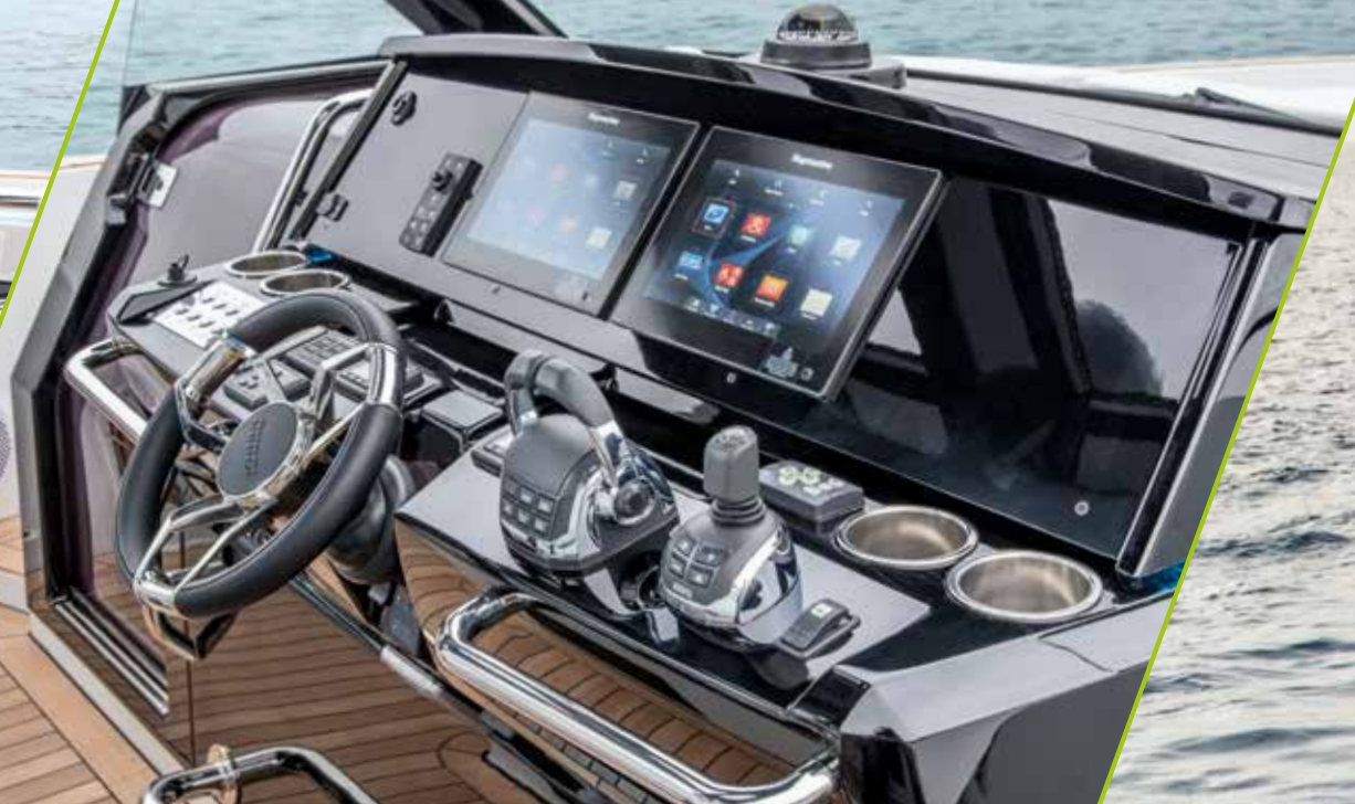
stylish and clearly arranged dashboard