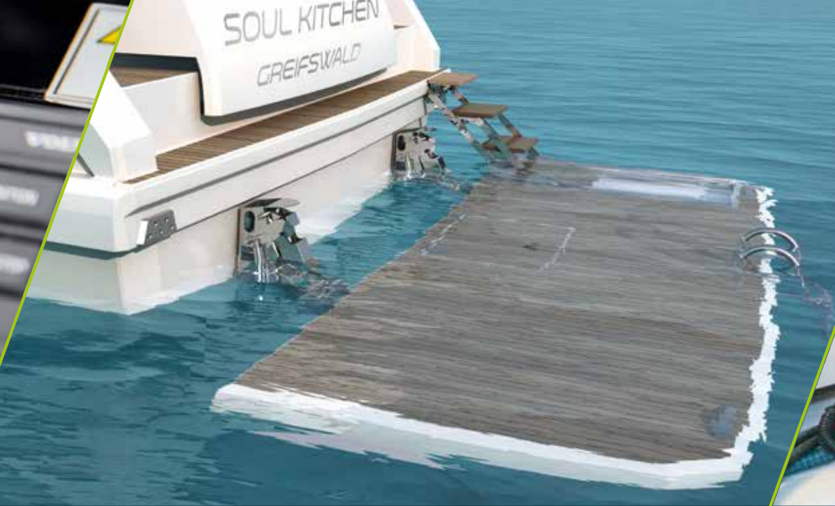
hydraulic bathing platform