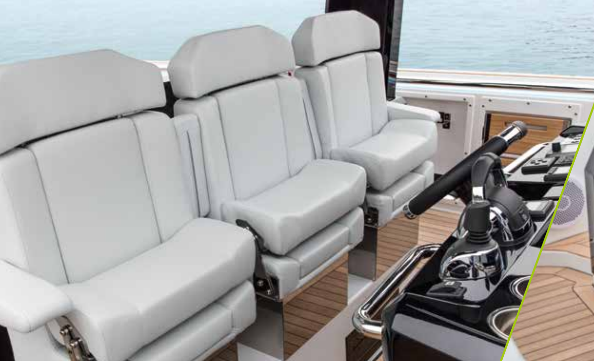
smart seat design for standing and sitting position