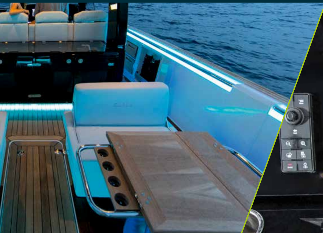
up to 16" Raymarine chart plotters