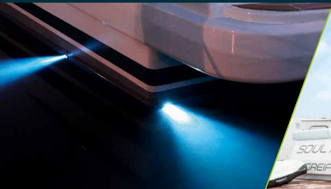
coloured courtesy lighting