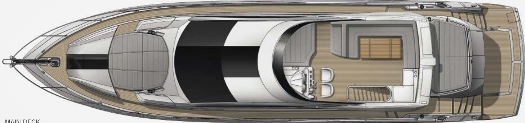
MAIN DECK Shown with optional Esthec side decking