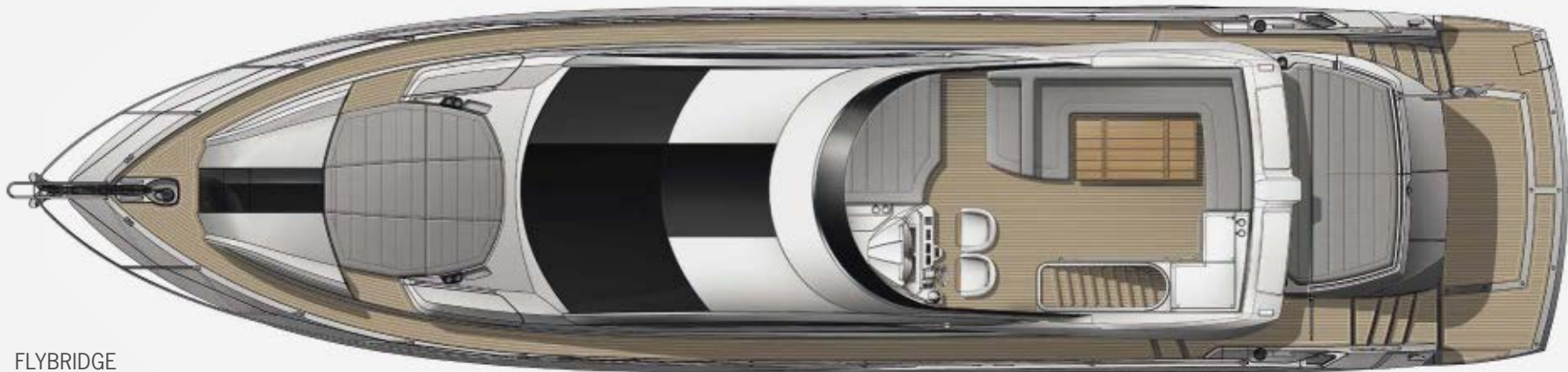
FLYBRIDGE Shown with optional Esthec side decking