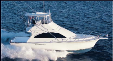
42 SUPER SPORT