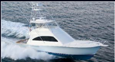
58 SUPER SPORT