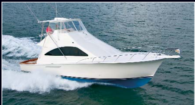
50 SUPER SPORT