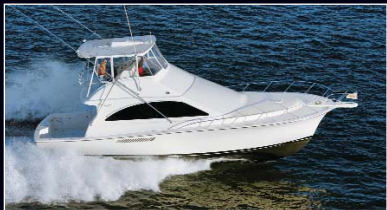
46 SUPER SPORT