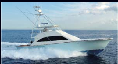
73 SUPER SPORT