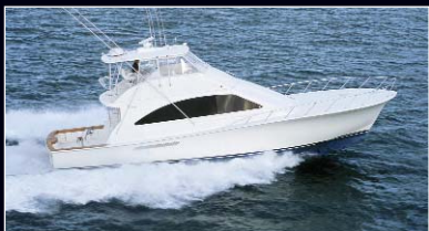
62 SUPER SPORT