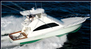
54 SUPER SPORT