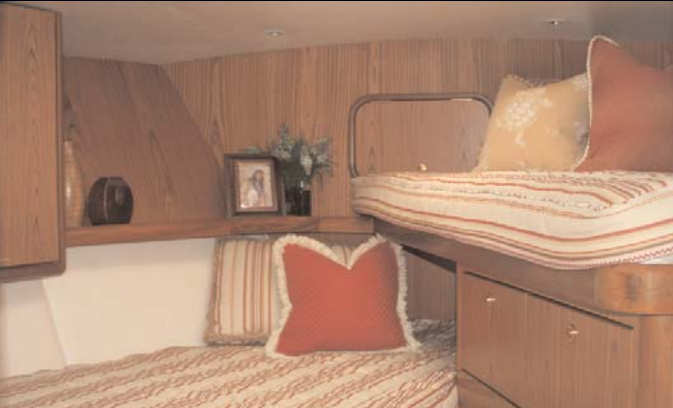
FORWARD STATEROOM - PLAN B