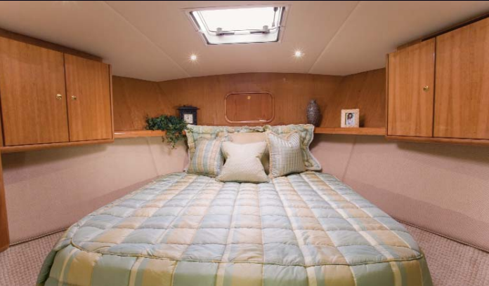
FORWARD STATEROOM - PLAN A