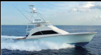
73 SUPER SPORT