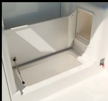
INSULATED STEP BOX AND STORAGE