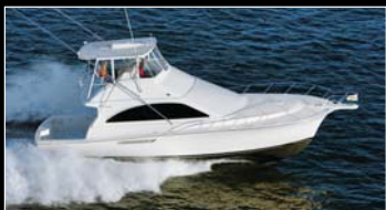
46 SUPER SPORT