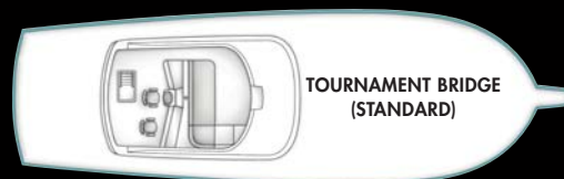
TOURNAMENT BRIDGE (STANDARD)

Speeds may vary due to sea conditions, equipment installations, bottom condition, number of people aboard and other variables that may affect performance.