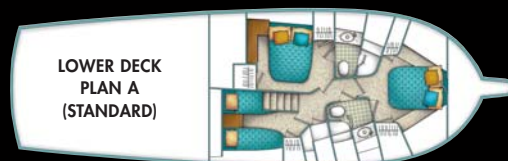
LOWER DECK PLAN A (STANDARD)