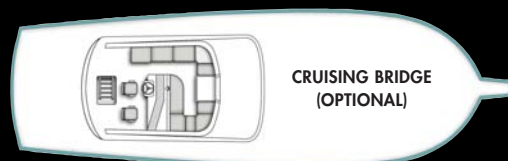
CRUISING BRIDGE (OPTIONAL)