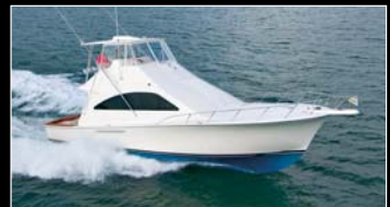
50 SUPER SPORT