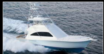
58 SUPER SPORT