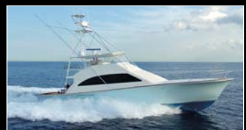
73 SUPER SPORT