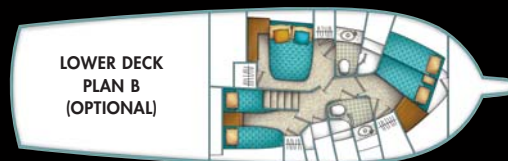
LOWER DECK PLAN B (OPTIONAL)