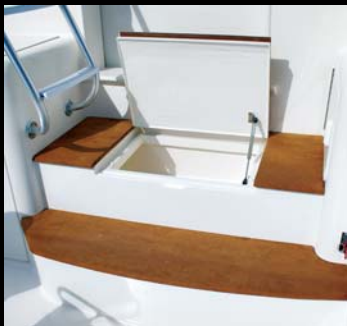
INSULATED DRINK BOX