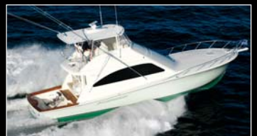
54 SUPER SPORT