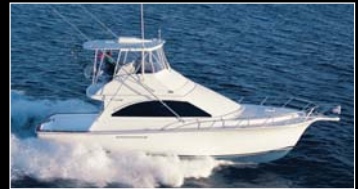
42 SUPER SPORT