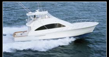
62 SUPER SPORT