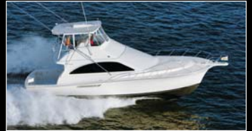
46 SUPER SPORT