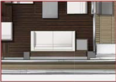
MAIN DECK OPTION Port side seating in lieu of storage unit