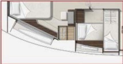
LOWER DECK OPTION Port twin guest cabin in lieu of VIP cabin walk-in-wardrobe