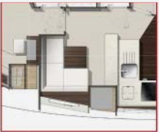
LOWER DECK OPTION Extended galley arrangement with optional outboard appliance