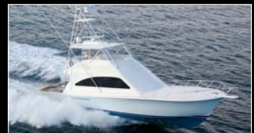
58 SUPER SPORT