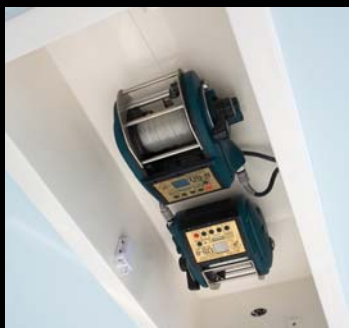
ELECTRIC TEASER REELS